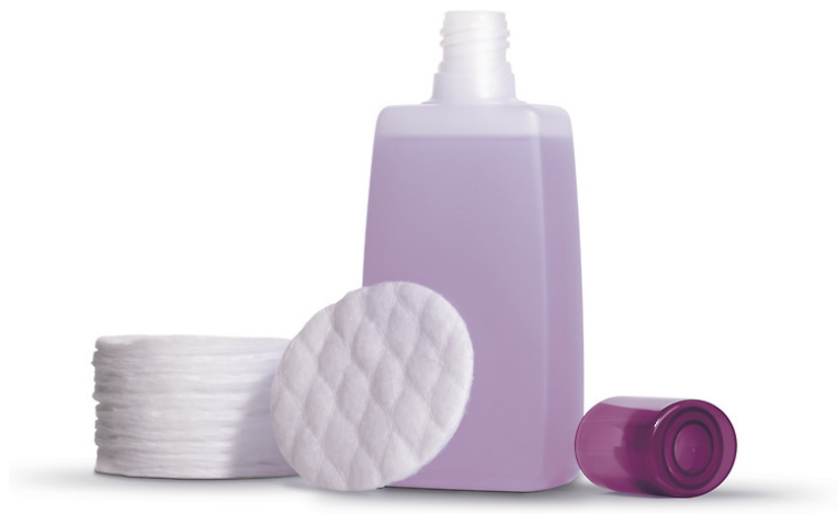
CombiTitrant 5 Keto together with CombiSolvent Keto are designed for samples containing aldehydes and ketones.

CombiTitrant 5 Keto and CombiSolvent Keto for the determination of water content in samples containing aldehydes or ketones. When performing water determinations with the Karl Fischer method in samples containing aldehydes and ketones it must be taken into account that these determinations are influenced by side reactions if methanol is used as a solvent. Methanol reacts with aldehydes or ketones to acetals or ketals and water. Additionally we have a second side reaction called the bisulfite addition. This reaction consumes water and therefore we need a very fast titration.